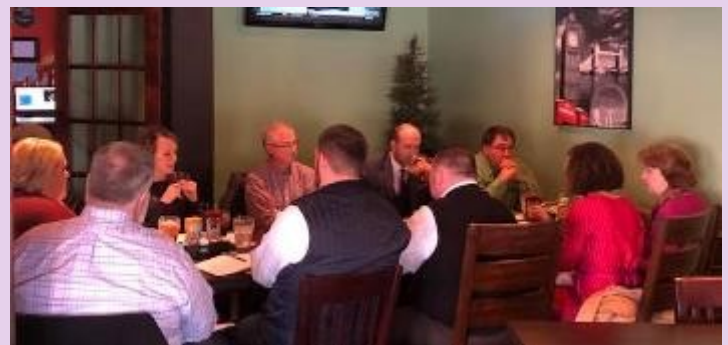
The London Downtown Board of Directors talking about exciting plans for 2018! It's great time to live in London KY!